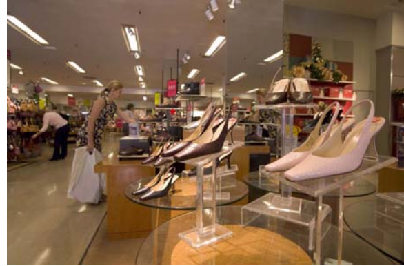
Macy's Department Store

There are many new retailers in downtown Houston. The greatest change has occurred in the Historic District. Since 1998, 34 new restaurants and bars have opened filling over 361,000 square feet of retail space. Most of these operations are centered around Main Street between Texas Avenue and Franklin.