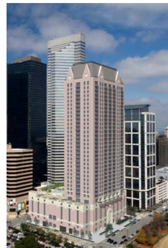
One Park Place

The full study conducted by UMC is available from Central Houston, Inc. and the Houston Downtown Management District or online at www.houstondowntown.com/Home/Business/DoingBusiness/Retail